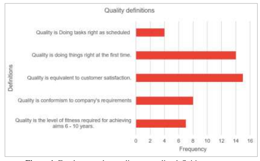
Figure 1. Employee understanding on quality definitions

The respondents were asked about their knowledge and understanding related to TQM. The first question in this section related to quality definitions. The first question in this section revealed that fifteen managers understand quality is equivalent to customer satisfaction (N=15) and followed by quality is doing things right at the first time (N=14). This is shown in Figure 1.